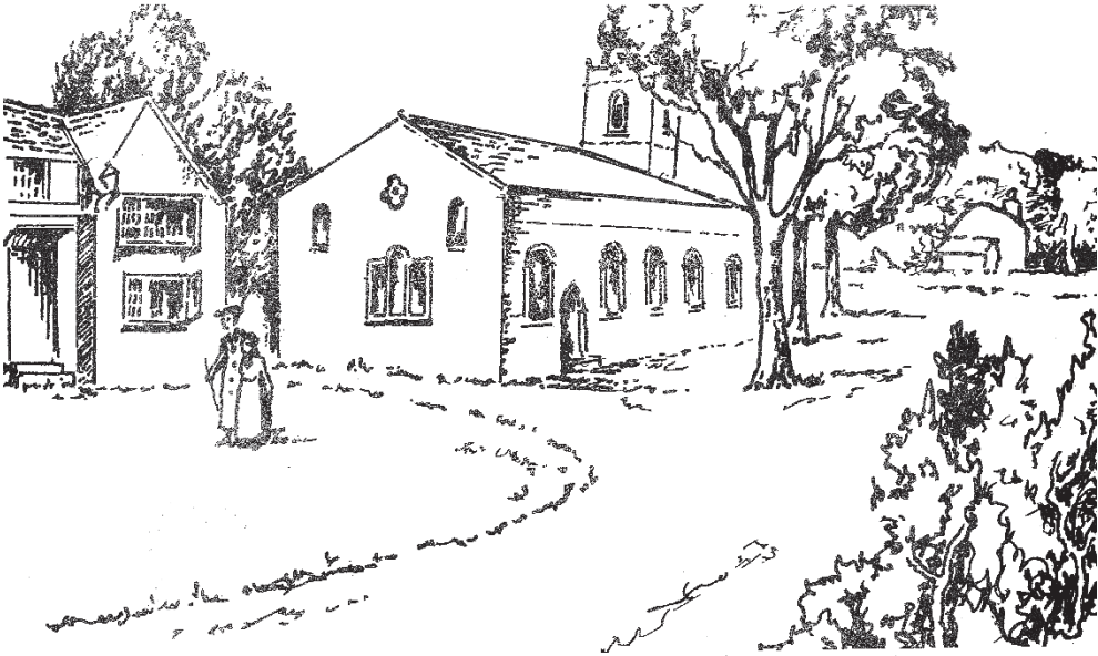
St. Elyyns Chapel 1618

Windle got its name from the Old English for Windy Hill, and the Windle family built their manor house, Windle Hall, there. Later the estate passed to the Gerard family through marriage, but eventually the family gave up living at Windle Hall, preferring other halls at Garswood and Birchley.